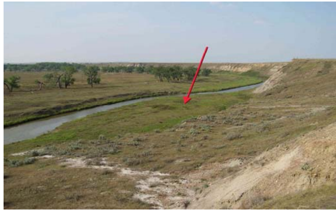
Figure 4. Recent alluvial deposits along the Grand River.