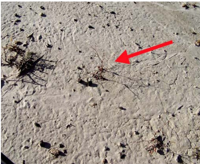
Figure 25. E. visheri in outwash flats below Hell Creek formation badland. Harding County, SD.

Six plants were located in dense, white, clay outwash at the base of a 3m-high badlands outcrop in the Hell Creek formation (Figures 25 and 26). Ground cover was 3%, sunlight was full, slope was 3%, and aspect was NE. All specimens were about 6" tall and in fruit. The population covered an area 2m x 2m. Only two species were in association with this population: Grindelia squarrosa and Eriogonum pauciflorum .