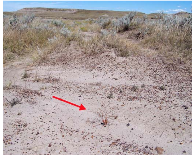
Figure 17. E. visheri growing in the middle of pasture road FS5747. Population number 1036.

No evidence of grazing or browsing was seen. Trampling was rare. The basal leaves of many did appear to have some insect damage ( Figure 15 ). Many plants had lost all green coloration despite the fact that they were still in bloom ( Figure 16 ). Some populations were stunted. A minority of the populations contained scattered plants that had died during the current growing season.