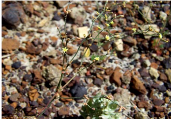
Figure 11. Flowering E. visheri growing in gravel-covered clay sideslope.