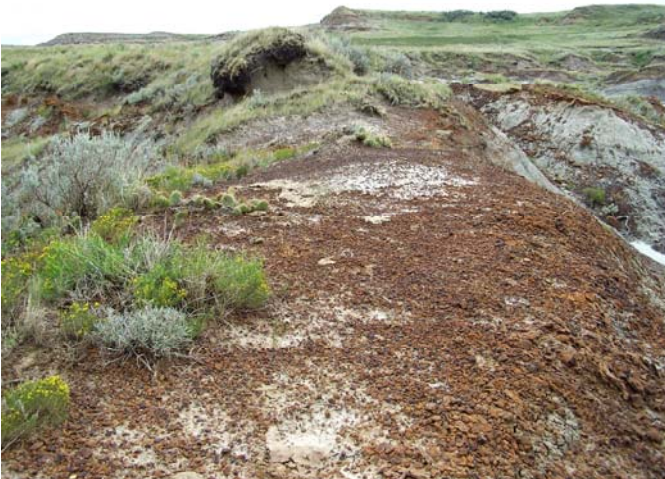
Figure 20. Convex ridge top typical of sites where chlorotic, necrotic, and stunted E. visheri plants were found.

by Opuntia polyacantha , Artemisia cana , and Bouteloua gracilis (Figures 21 and 22). Slopes and erosion were relatively low, resulting in more advanced soil development than the E. visheri sites. Parent material was likely Hell Creek formation. All six populations were in the eastern half of the survey area. GPS data was collected for five of the populations. No data was collected for the population in Pasture 9, Section 35.