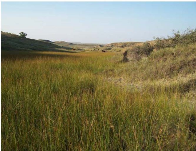
Figure 24. Tall sedges fill a series of springs seeps along valley floor at base of embankments.

Many springs dot the landscape. Some have been developed. Most lie at the base of a ridge or embankment (Figure 24).