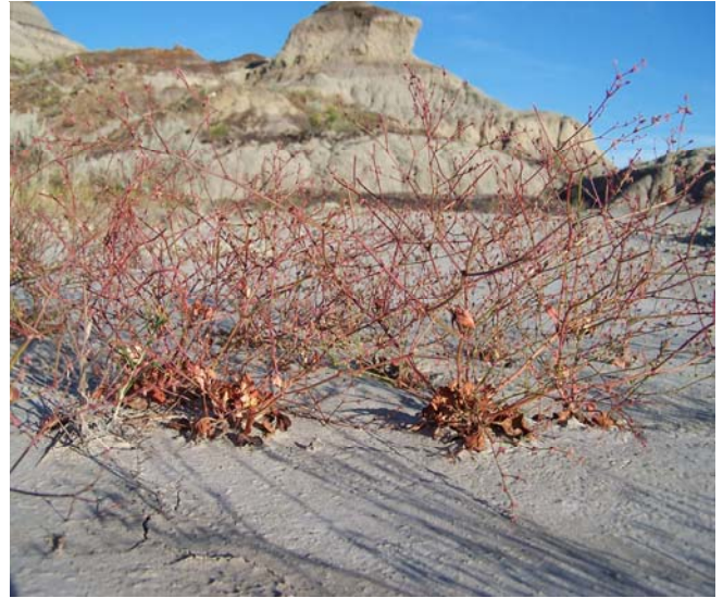
Figure 16. Chlorotic E. visheri in bloom, growing in outwash flats below badlands.

Slope: Most specimens grew on the flat outwash below badland buttes. When found on steeper slopes, they were usually in the midst of gravel, which stabilized the soil and created safe-sites for germination. In the rare instance that they grew on bare clay sideslopes, it was in the cracks within popcorn-weathered clay ( Figure 15 ).