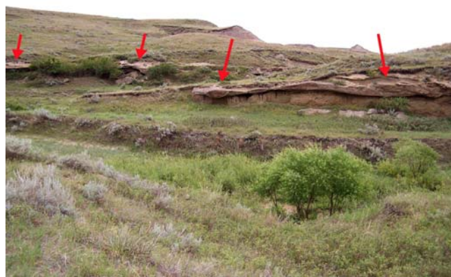
Figure 2. Ludlow formation badlands.

marks, and bird and animal tracks. It has produced many excellent and renowned dinosaur skeletons, including Triceratops and Tyrannosaurus rex . Most of the badland topography in the survey area is Hell Creek formation. The Ludlow formation is of more recent origin and lies on top of the Hell Creek formation ( Figure 3 ). It is composed of bedded clays and sandstones interlayered with lignite. This formation is predominant on the rolling, grassy terrain typical of the higher elevations of the survey area. The riparian areas along the Grand River contain modern and older alluvium and alluvial fans as well as slumps and cut banks ( Figure 4 ).