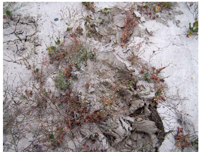
Figure 18. Cattle trampling on E. visheri population. Reddish foliage indicates damage.

Development: The survey area has seen relatively little development over the years. There are a few pasture fences, about one-half dozen wells, and some pasture roads. There is an old homestead in Pasture 9, Section 35. But none of these appeared to impact the populations of E. visheri . In fact, some individual plants were growing in the center of pasture roads ( Figure 17 ). During the month-long course of this survey, only four other vehicles were seen: two contained antelope hunters, one contained sightseers, and one contained ranch hands.