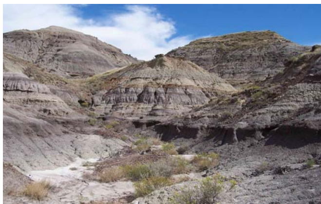
Figure 1. Hell Creek formation badlands.

The geologic formations in the survey area are late Cretaceous Hell Creek formation or early Tertiary Ludlow formation ( Figure 1 ). The Hell Creek formation is mostly bedded clays with lesser amounts of sand and lignite ( Figure 2 ). It contains sedimentary features such as siderite nodules, mud cracks, raindrop impressions, ripple