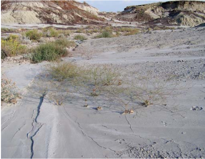
Figure 6. E. visheri growing along rivulets on outwash below badland buttes.