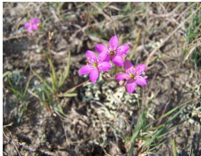
Figure 22. Closeup of Talinum parviflorum .

Six populations of Talinum parviflorum , or Fameflower, were found in the course of these surveys. It is listed in North Dakota as S2, in South Dakota as SNR, and is not listed with the GRRD. The plants were situated on slickspots on the prairie that were dominated