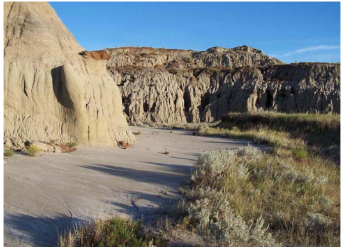
Figure 8. Miniature alluvial fans at base of badland butte.

Soil: More often than not, this species grew on badland outcrops, that is, on the exposed, raw parent material or the primary erosional debris of the parent material. Actual soil development on these outcrops was negligible. The vast majority of these populations were on the miniature alluvial fans at the base of badlands buttes ( Figure 8 ), sideslopes of badland outcrops ( Figure 9 ), or slickspots on the prairie flats ( Figure 10 ). Almost without exception it grew in dense gray to white clays. The clays occupied by E. visheri had high shrink-swell capacities. It has been surmised that these clays limit competition and succession, creating the thin vegetation structure that favors E. visheri . Clays with red to orange hues, likely due to oxides of iron, rarely supported a population of E. visheri . In those few locations where it grew in sand, the sand was shallow and underlain by clay. Often it was seen in association with gravel, but this was also a shallow deposit over clay. The stones may have served to create safe-sites for the germination of seed ( Figure 11 ). The species tended to attain greater vigor and stature on darker clays, the darker chromas presumably an expression of a higher organic matter content. The species was rarely found in close association with selenium-, sodium-, or alkali-tolerant vegetation. The absence of populations on lignite suggests an aversion to sulfur or the lower pH that might accompany coal strata.