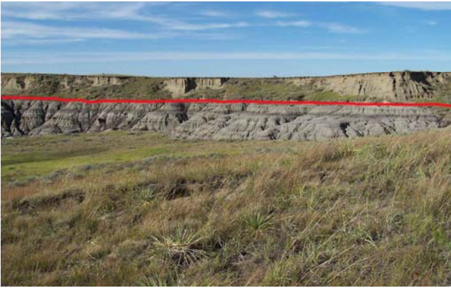
Figure 3. Hell Creek and Ludlow contact (red line).