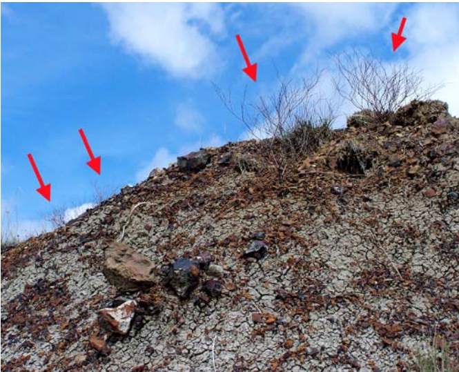
Figure 19. Skeletons of E. visheri from previous season on exposed ridge. No live specimens were on this ridge.