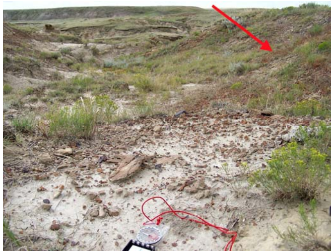
Figure 13. Arrow shows E. visheri on SE face of slope only. Compass in foreground. Photo facing to SW.

Despite what appeared to be favorable soil and geology, it was uncommon to find E. visheri in close proximity to populations of Astragalus racemosus , Atriplex nuttallii , Ceratoides lanata , Eriogonum pauciflorum , Opuntia polyacantha , Polygonum arenastrum , Melilotus officinalis , Schizachyrium scoparium , the lichen Hypogymnia psycodes , or sandy soil indicators such as Calamovilfa longifolia . Some of these species are tolerant of selenium, sodium, or alkaline, suggesting that soil chemistry was a primary factor that excluded E. visheri .