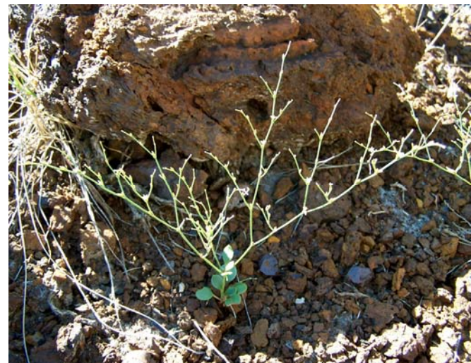
Figure 14. E. visheri growing in shadow of boulder.

Exposure: Each population and almost every individual specimen were in open light conditions. The occasional plant was found in the shadow of a cutbank, a steep ravine, a boulder, or a shrub (Figure 14).