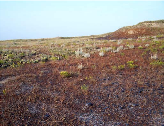
Figure 12. Very dense cover of reddish E. visheri growing on gravel-covered clay outwash.