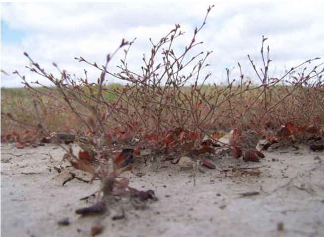
Figure 5. Dense lawn of Eriogonum visheri in Section 14.