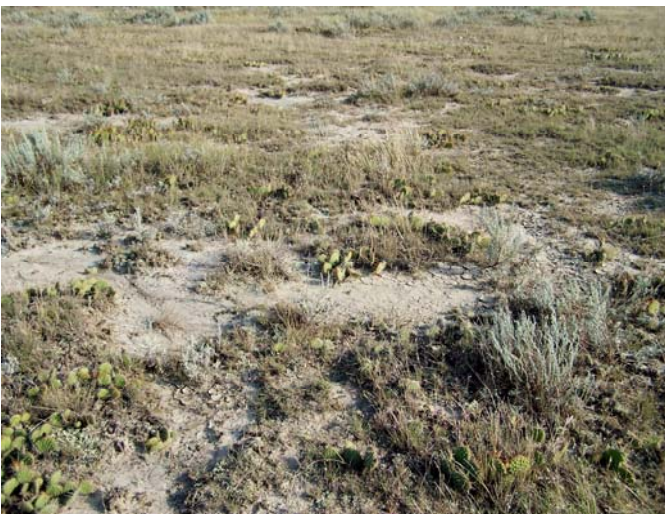
Figure 21. Overview of Talinum parviflorum slickspot habitat.

by Opuntia polyacantha , Artemisia cana , and Bouteloua gracilis (Figures 21 and 22). Slopes and erosion were relatively low, resulting in more advanced soil development than the E. visheri sites. Parent material was likely Hell Creek formation. All six populations were in the eastern half of the survey area. GPS data was collected for five of the populations. No data was collected for the population in Pasture 9, Section 35.