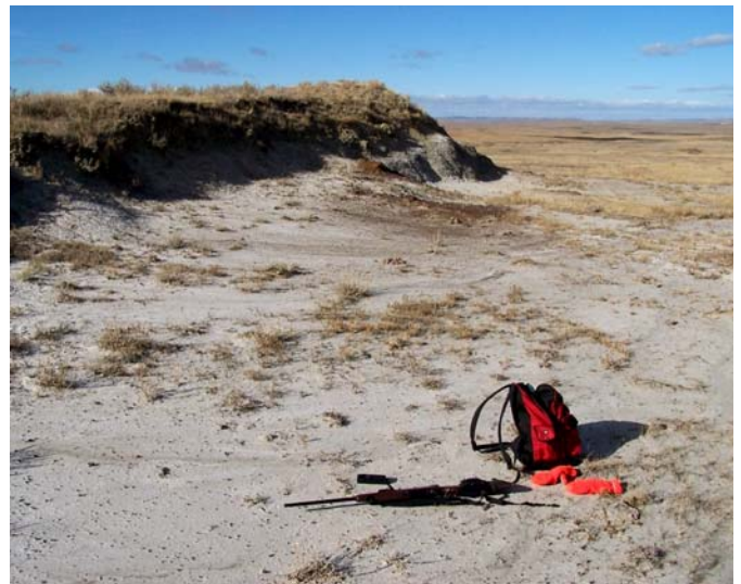
Figure 26. Overview of E. visheri in Hell Creek formation habitat. Harding County, SD.