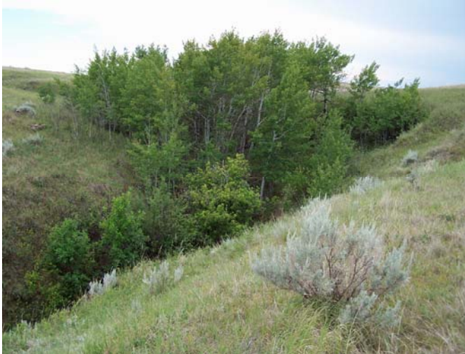
Figure 23. Overview of Populus tremuloides grove in steep-sided canyon in Pasture 9, Section 10.

Approximately 1850 plants were seen on about 255m 2 or 0.063 acre. The average population had 308 plants over 43m 2 or 0.01 acre. All populations were in flower, robust, and gave no evidence of injury, predation, parasitism, or grazing.