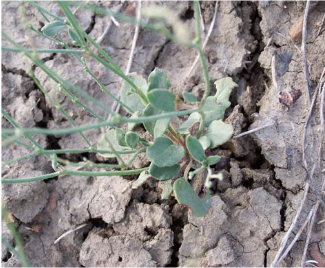
Figure 15. Closeup of E. visheri growing in a crack in popcorn-weathered clay sideslope. Note apparent insect damage.