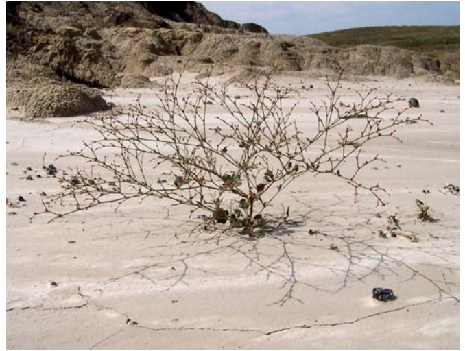
Figure 7. E. visheri growing in outwash flats below badlands.

Erosion: After parent material, erosion seems to be the fundamental determinant of habitat suitability. The Hell Creek and Ludlow formations—composed of poorly consolidated mudstones, siltstones, and sandstones—are very prone to weathering and erosion. Intense precipitation episodes, common on the Great Plains, result in high erosion rates. Vegetation is often buried in sediment or uprooted by runoff. This creates the open site conditions, relatively free of competition and succession, in which E. visheri thrives. Thus, it was common to find E. visheri growing on the banks of rivulets or on the outwash of badlands buttes ( Figures 6 and 7 ).